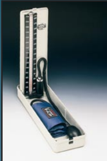
Baumanometer® Blood Pressure Standard The World Over.

W.A. Baum Company has specialized in the manufacture of scientifically accurate clinical sphygmomanometers for more than 85 years. Each instrument is built to agree with our master